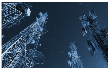
TELECOMM SERVICE SOLUTIONS