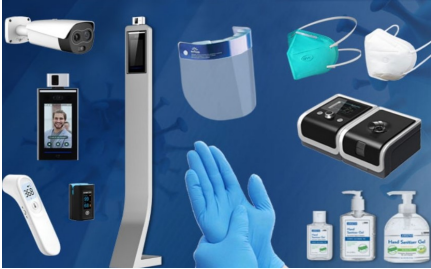
COVID 19 PPE / VIRUS CONTROL SOLUTIONS