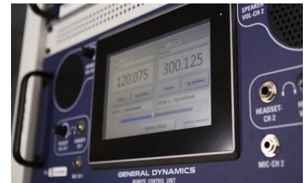
GROUND-TO-AIR AND LOS RADIOS