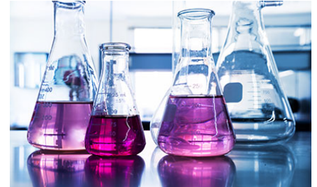
CHEMICALS/ CUSTOM PRODUCT DEVELOPMENT