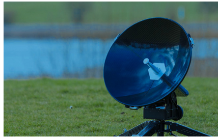
ALL SIZES OF SATCOM TERMINALS