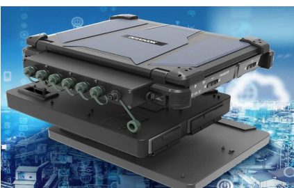
COMPUTERS AND RELATED SERVICES